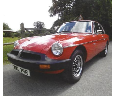
Last MGBGTV8 (Flamenco Red 2903)