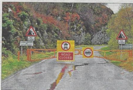
Strome ferry bypass was closed for four months in 2011 after a landslide.

From Monday September 3, the A890 will be closed overnight between Ardnarff and west of Attadale from 10pm to 7am. Traffic lights will be in operation during the day between 7am and 10pm while a road to rail bypass road is installed. The contractor has been allowed up to two weeks for the installation of the bypass road but may complete this sooner.