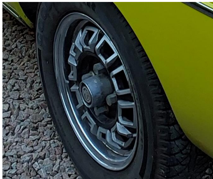
V8 Register – MG Car Club