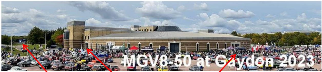
Western Arena parking area (6) Museum entrance (A) Northern Arena parking area (4)