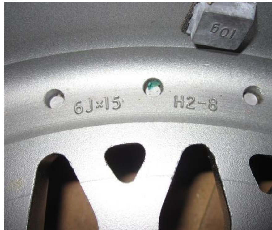
Size marking – 6J x 15