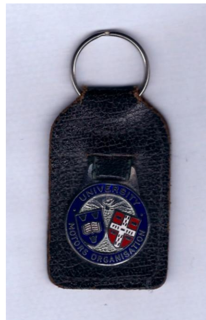
Key fob provided by UM

University Motors had a branch with showrooms and a parts counter in Church Street in Epsom.