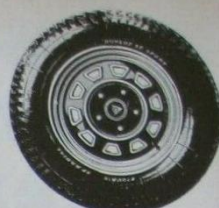
FORMULA D4 Alloy/steel composite wheel