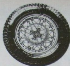
FORMULA D3 Bolt-on wire wheel