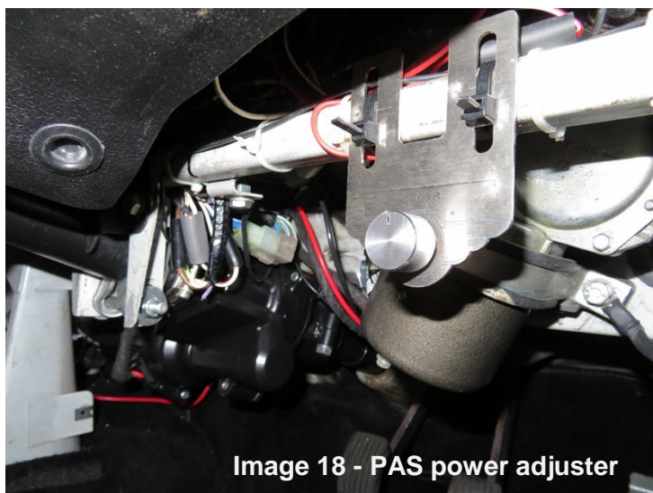
Image 18 - PAS power adjuster