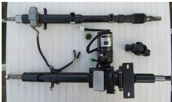
EZ EPAS kit

Caution with handling the steering column – the caution is important because the collapsible column can be damaged by any mishandling. Replacement steering columns are impossible to find and repairing a damaged collapsible column has been a controversial topic. Risk of steering column damage