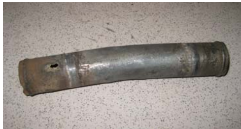
Steel pipe connecting the two lower cooling hoses is badly corroded with a hole.