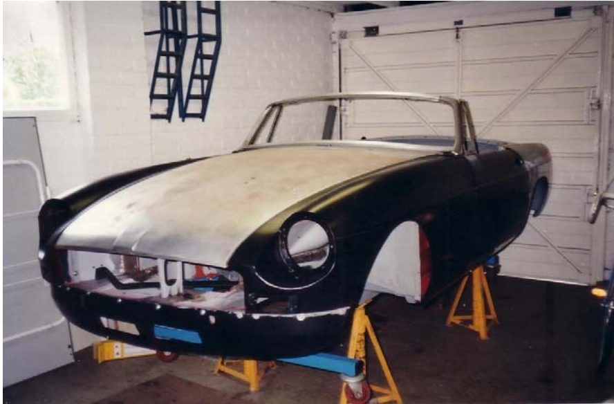
Heritage shell fitted with an aluminium bonnet.