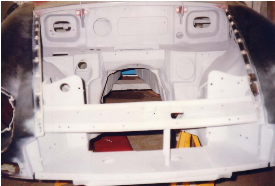
Underbonnet and radiator mounting panels in primer/filler awaiting first coat of cellulose paint.