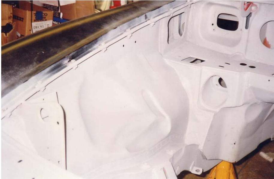
Off-side of the engine bay.