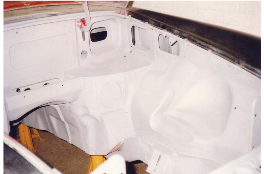
Nearside of the engine bay.