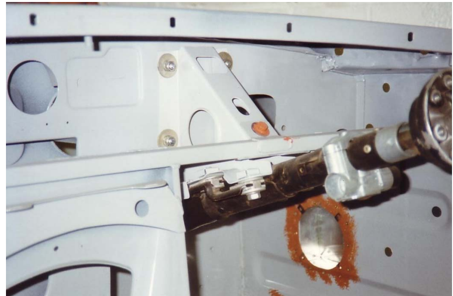
Cut outs for the loudspeakers in the legwells.