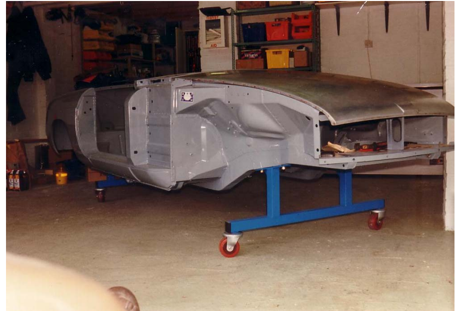
Bare shell in primer.