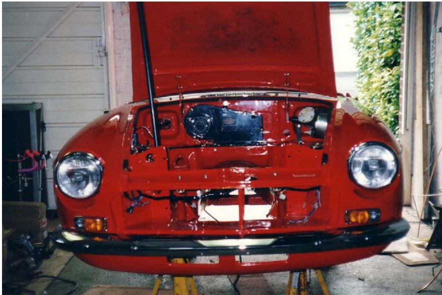
V8 front wiring loom, heater, lights, bumper and brake servo fitted.