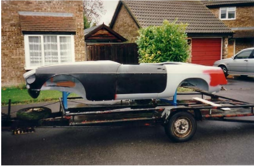
Shell ready for painting.