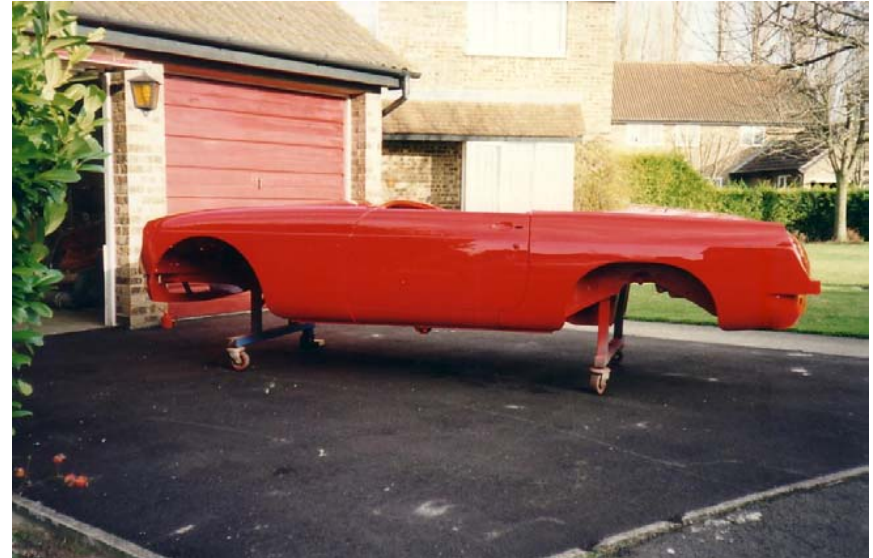
Shell returns from painting.