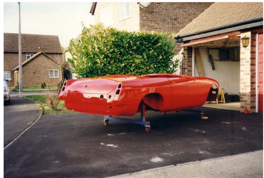
Shell looks good in VW Tornado Red cellulose paint.