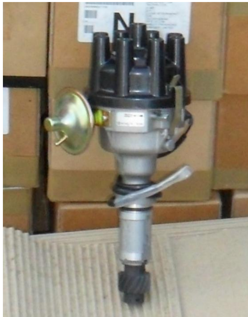
New 35D8 V8 distributor available from the Distributor Doctor