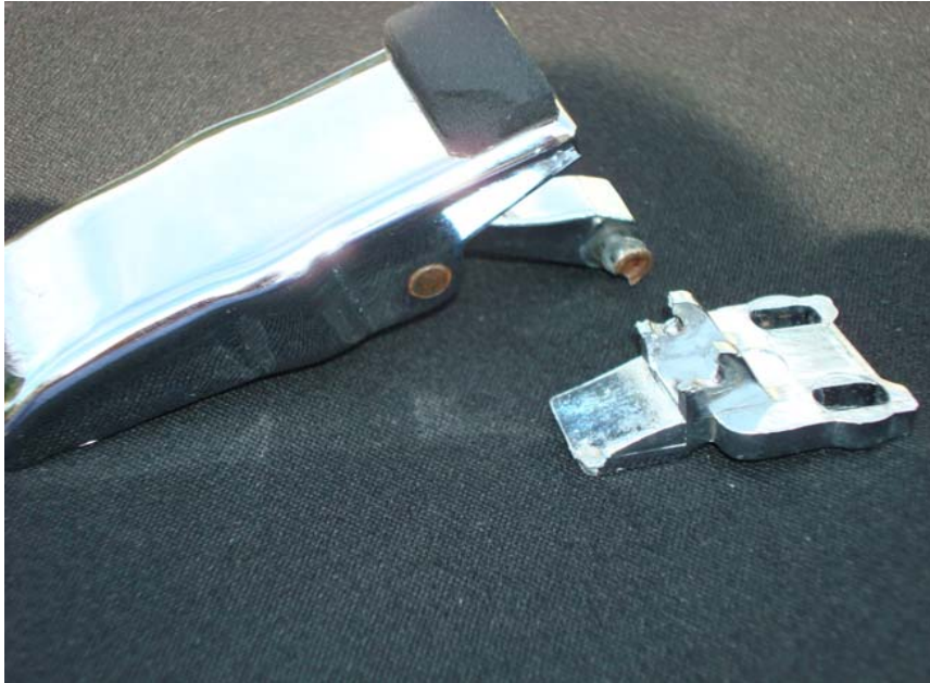
Fractured hinge on the hood toggle catch