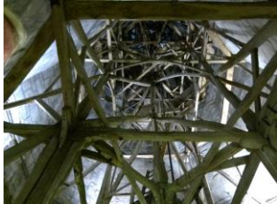
Medieval scaffolding still braces the spire at Salisbury Cathedral.