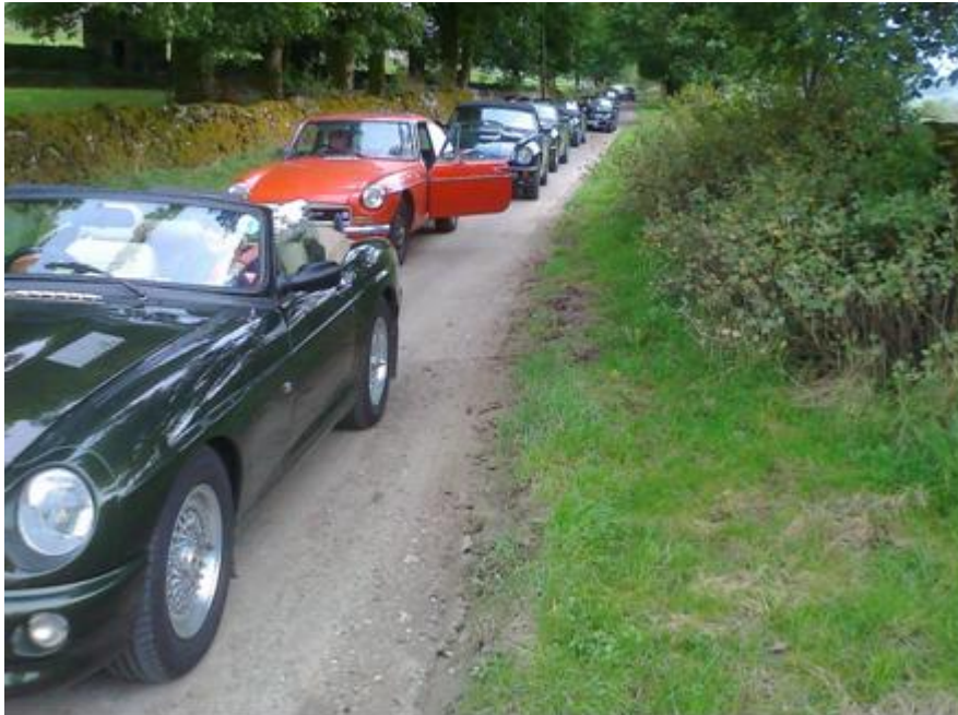
Resting up while the cows come in.