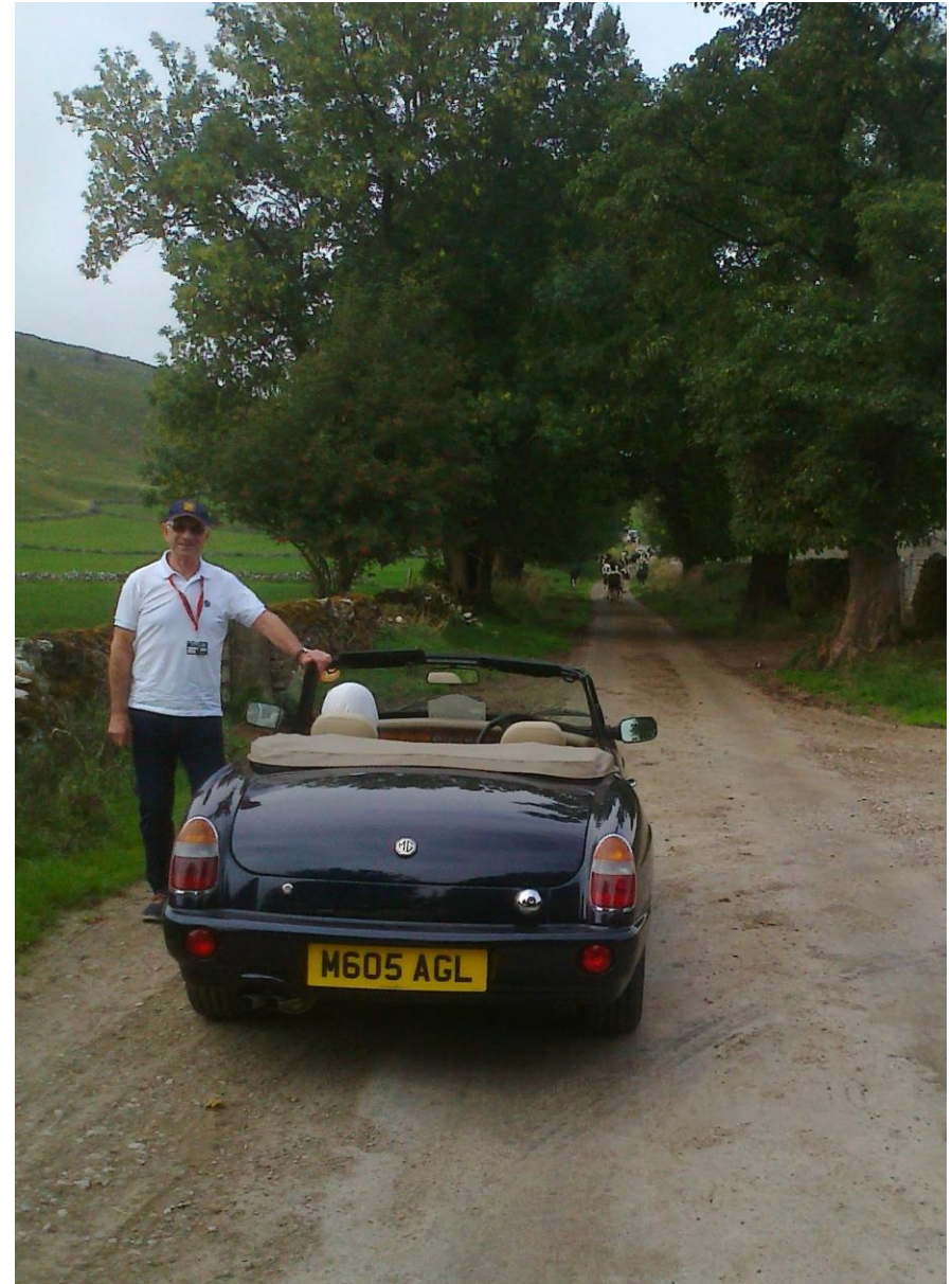
Cattle ahead! Several MG V8s pull up as the cows are in the road being brought in from the fields for afternoon milking. Once the herds were inside the farm gate and the road was clear, dodging the cow muck plastering the road was a serious business!