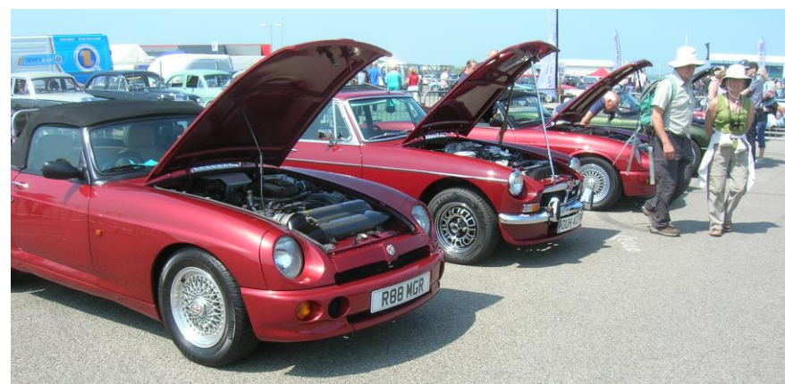
Four MG V8s in the concours – beautiful sunshine on Sunday.