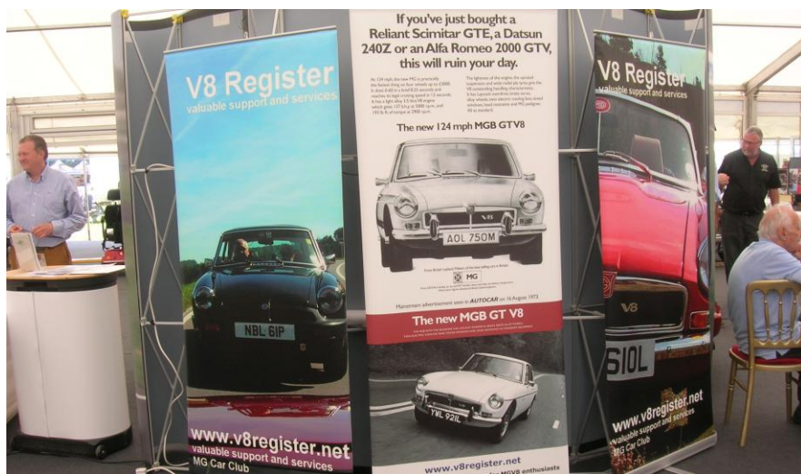
Back of the V8 Register display in the Main Marquee.