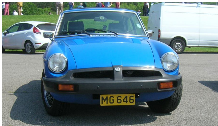
Does anyone know the member who came to MGLive! 2016 with this MGBGT V8?