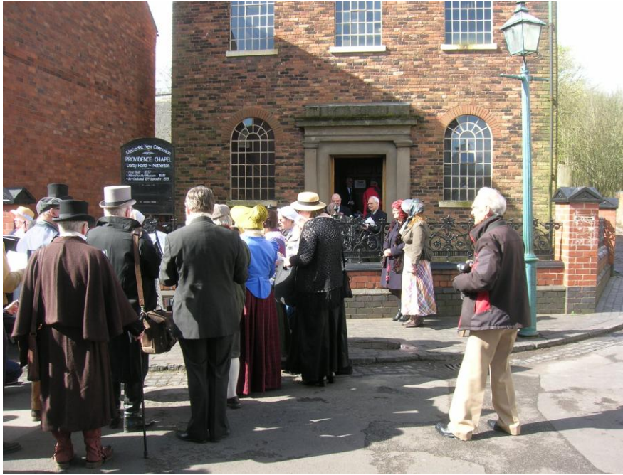
Outside the Providence Chapel (44) the congregation were singing in the sunshine celebrating an anniversary of the Methodists arriving many years ago.