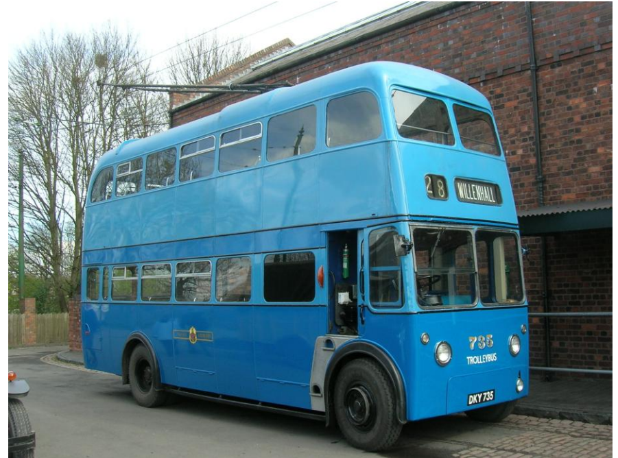
Trolley Bus – a quiet form of public transport from another era.