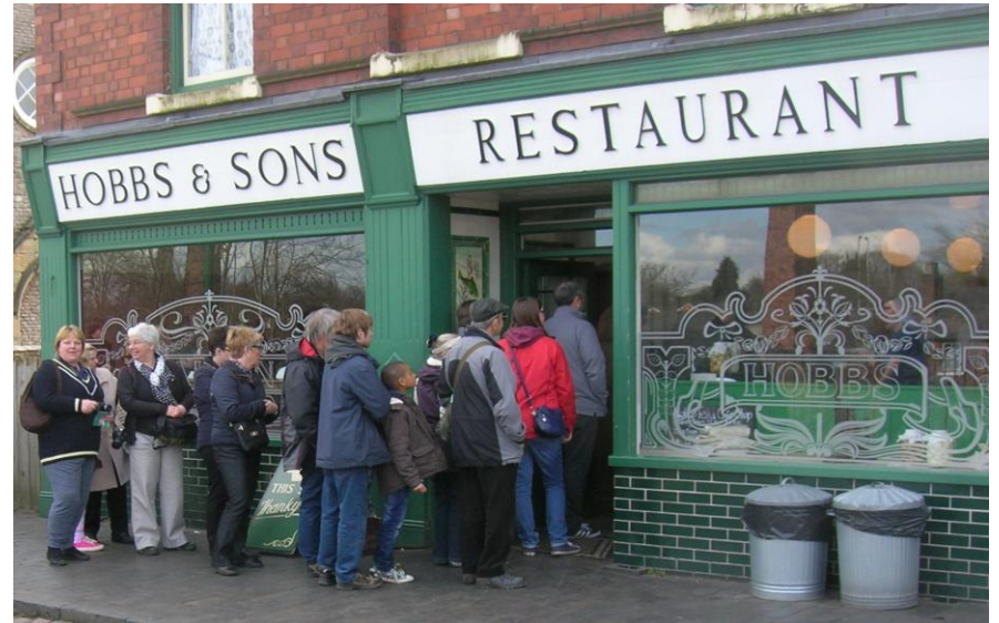
Fish & chips were popular at Hobbs & Sons Restaurant (24).