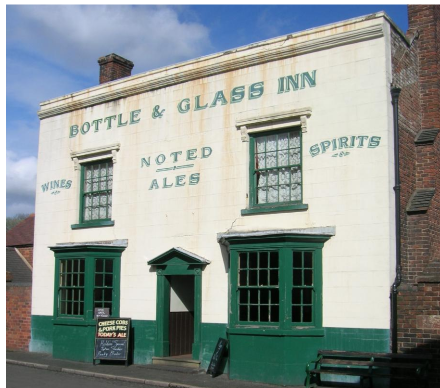
The Bottle & Glass Inn (54) conveniently placed facing the chapel.