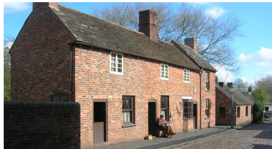
Station Road Cottages (55) with a lady sitting in the sunshine.