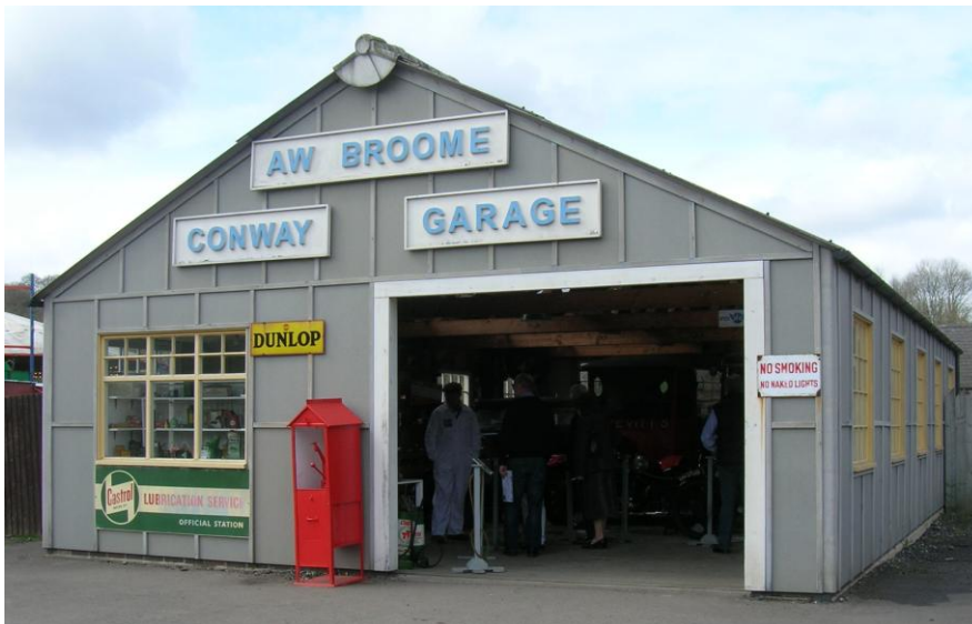
The Conway Garage (21) – servicing cars and motorcycles