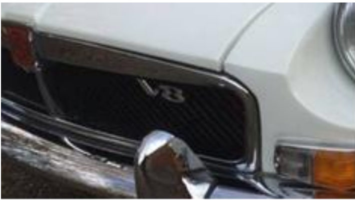
On this chrome bumper grille the V8 badge is too high and too far to the nearside of the grille. Note also the restorer has got the sidelight-indicator light unit the wrong way round too! The side light should be on the outside marking the edge of the front of the car and the indicator inside.