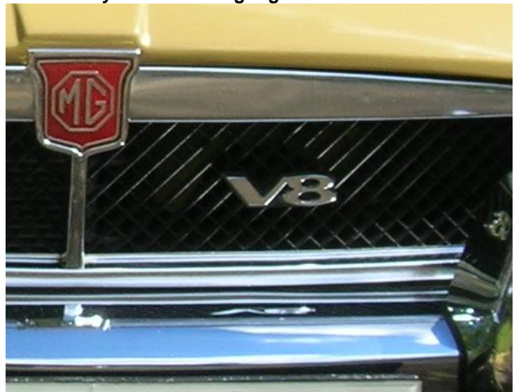
An original grille mesh fitted to a chrome bumper MGBGTV8.