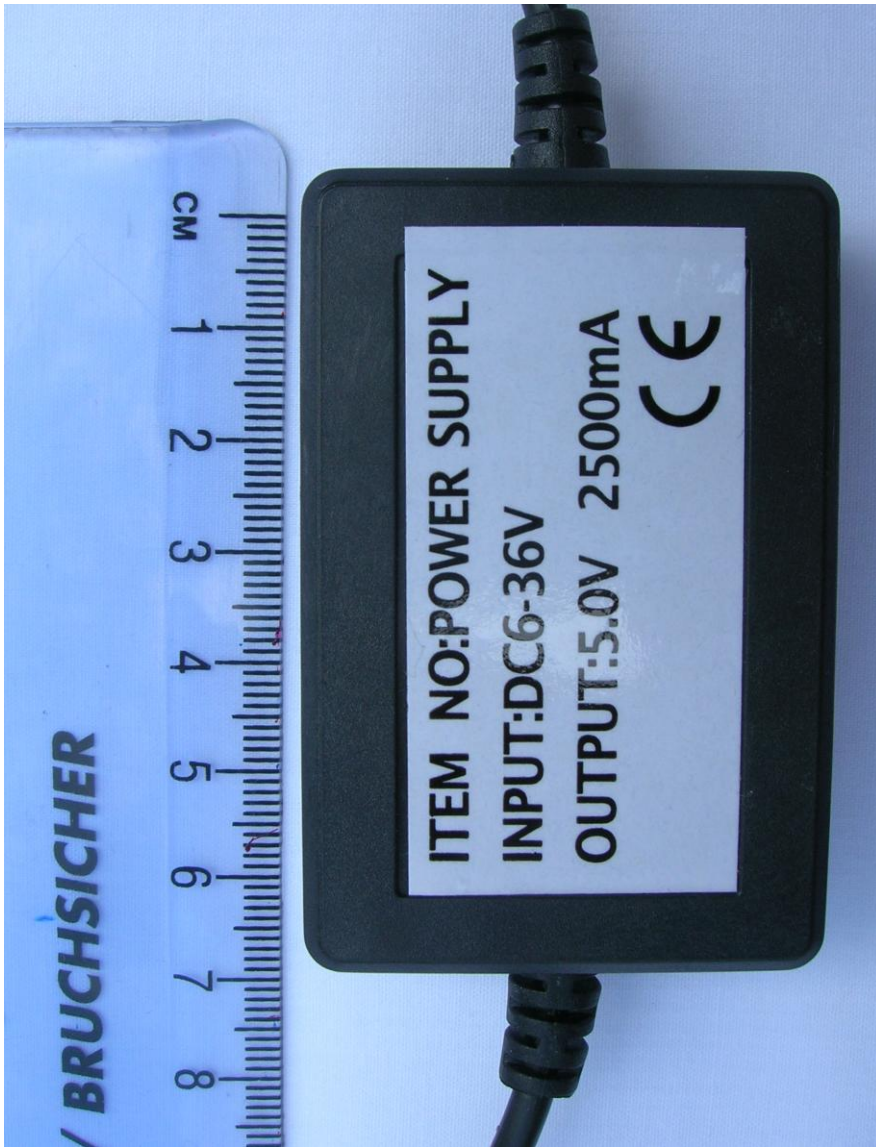
Power supply unit