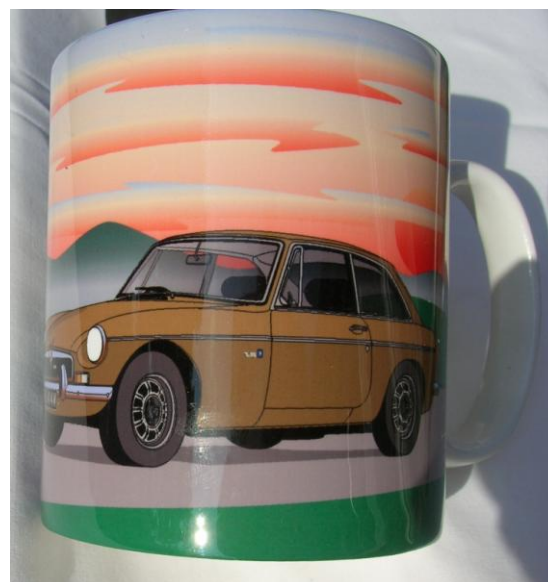
V8 35 th Anniversary Mug.