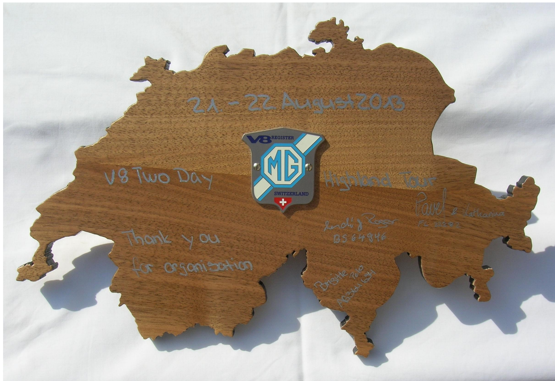
Swiss V8 Register trophy.