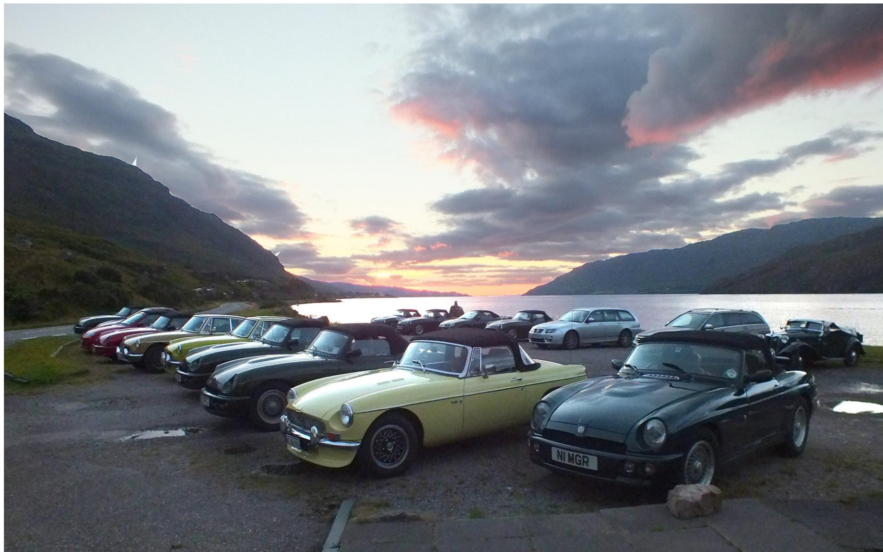
Sunset down Little Loch Broom