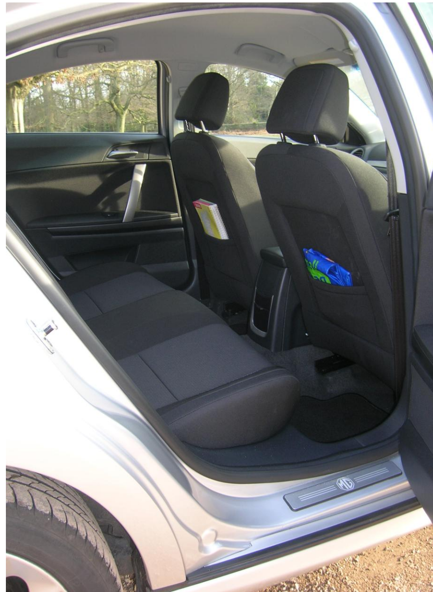
Excellent legroom for a passenger in the rear seat and ease of access.