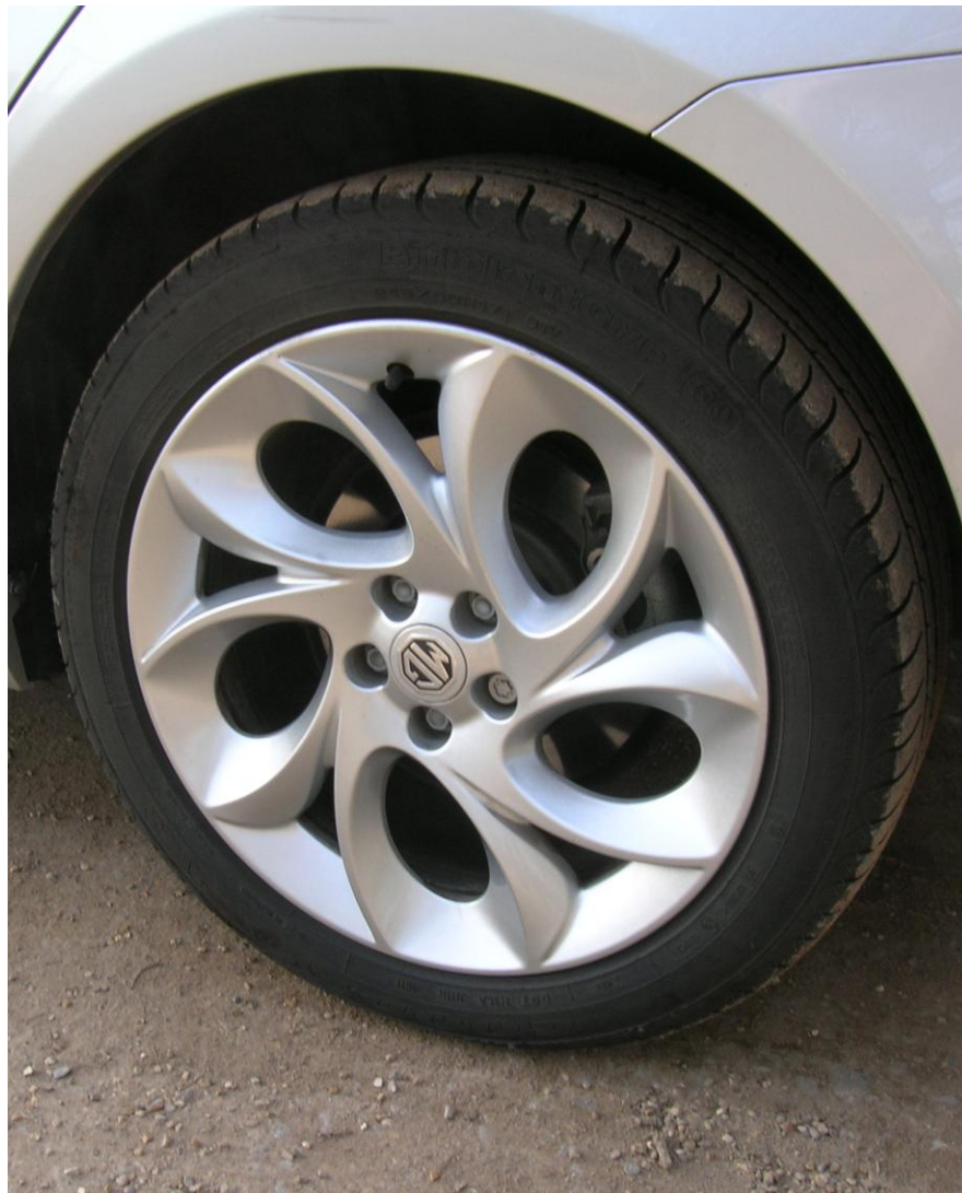
17" twist sports alloy wheels.