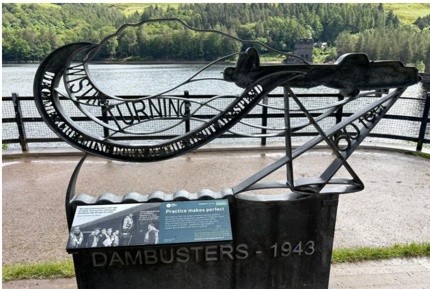
Memorial to the brave RAF crews that practiced on this reservoir.