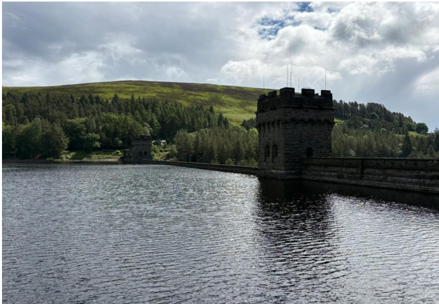
Ladybower Dam in the Derwent Valley.