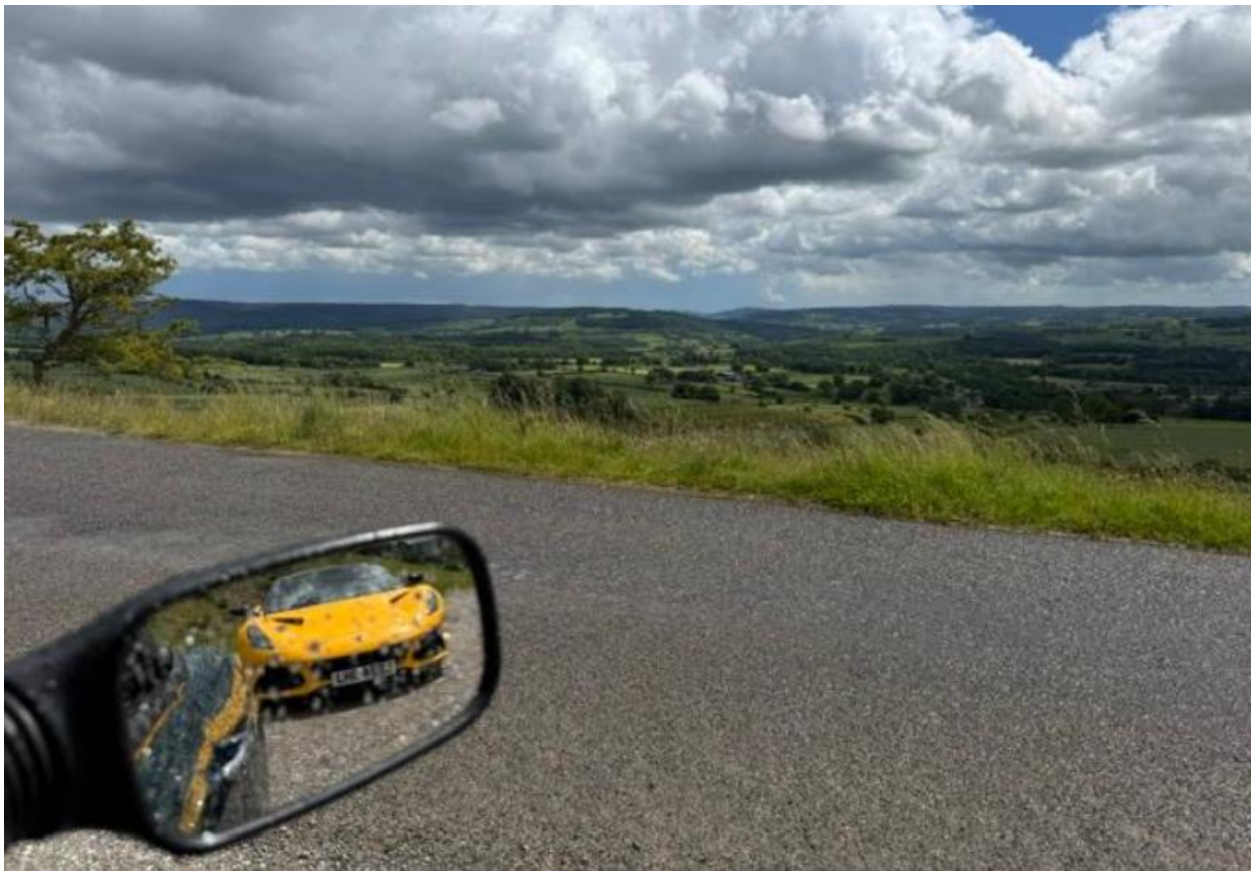
Longstone Edge north of the village of Great Longstone, which is in turn about 2 miles (3 km) north of Bakewell. Stormy clouds on the horizon.