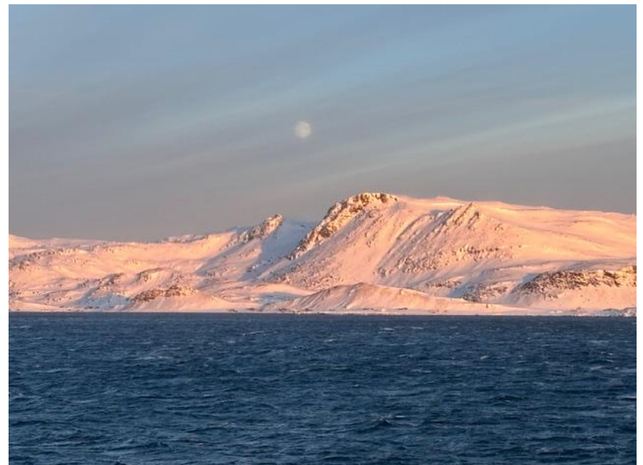
Bergen – Kirkeness – Bergen roundtrip. Hurtigruten