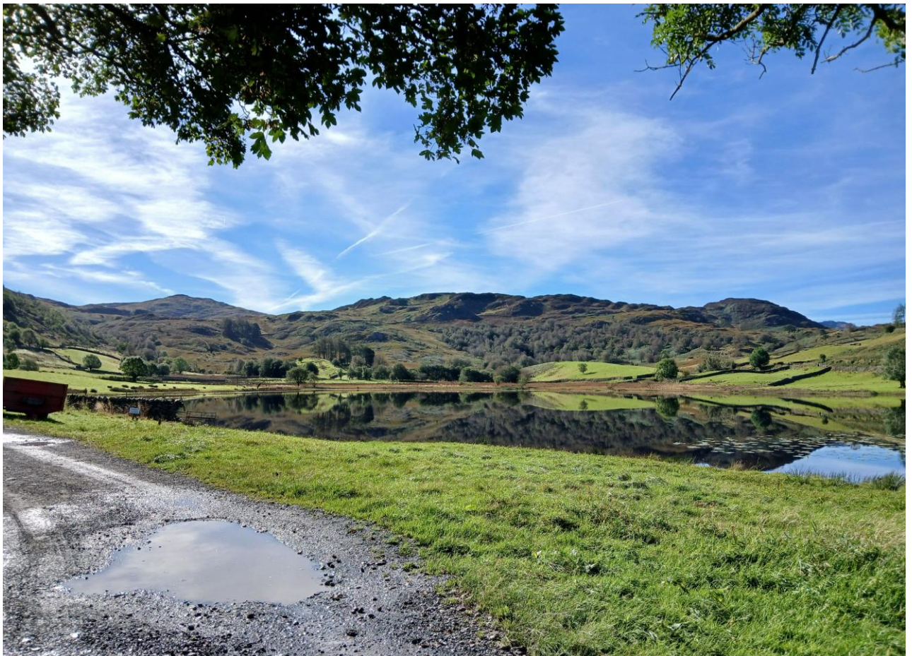
Watendlath Tarn - tis is fed from Blea Tarn and flows down to Derwent Water under Ashness Bridge.