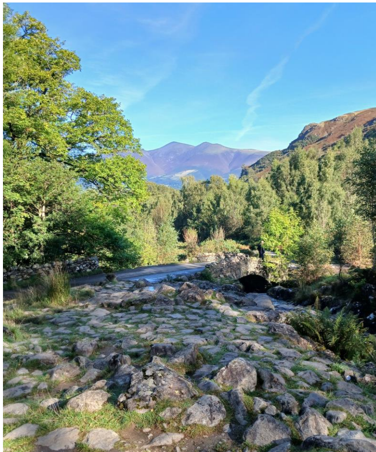
View of Skiddaw from Ashness Bridge.