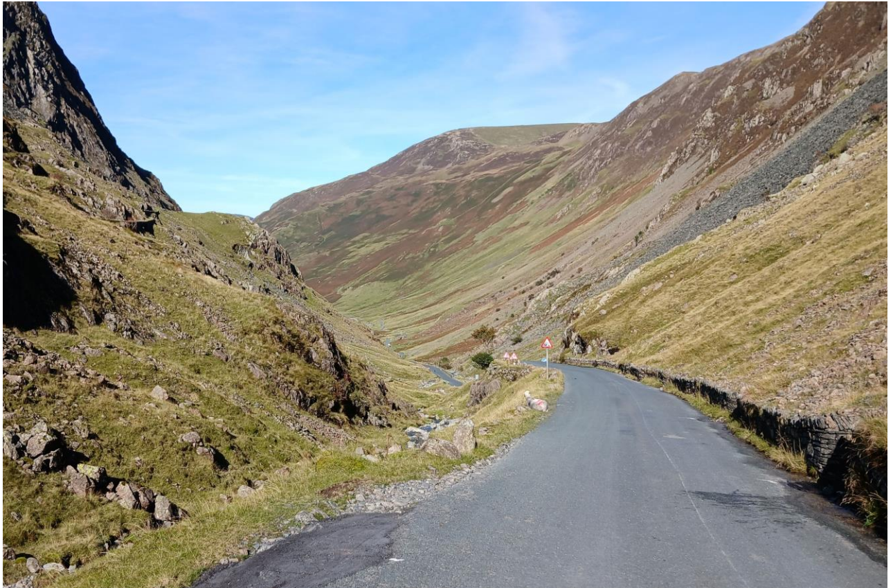
Going towards Buttermere on Honister Pass.