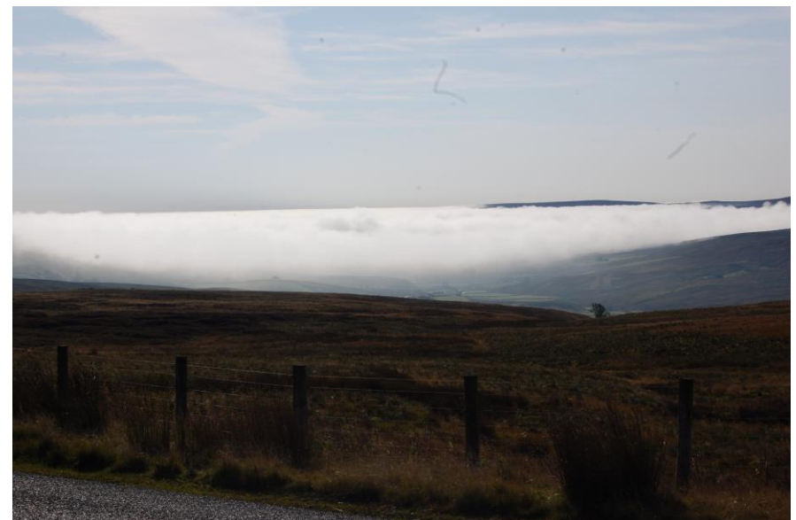
Cloud cover caused by a temperature inversion we all witnessed en route to High Force - the water in the valley below would have been much cooler than the air temperature.