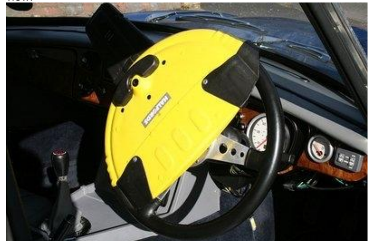
Mike Howlett relies on a steering wheel locking device he bought from Halfords some years ago which is an ideal size for the MGB.

Type A2 trackers with GSM and RF location for indoor and outdoor recovery without GPS but it will always need an RF local signal finder using VHF or UHF radio direction signal finding equipment to help locate and recover items hidden from satellite view.