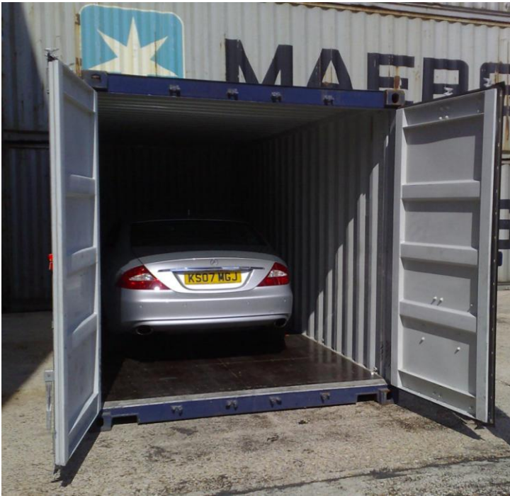
Car stolen in Birmingham was traced with a tracker to Southampton docks and recovered from inside a shipping container.