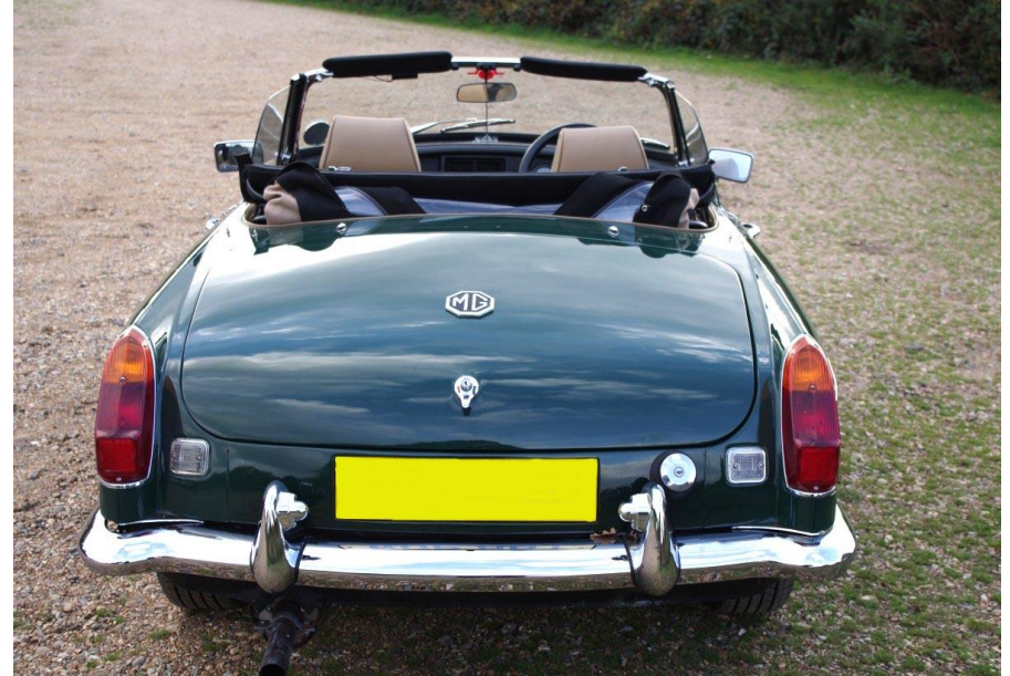
Re-trimmed interior in Barley with Classic leather seats, reconditioned dash.