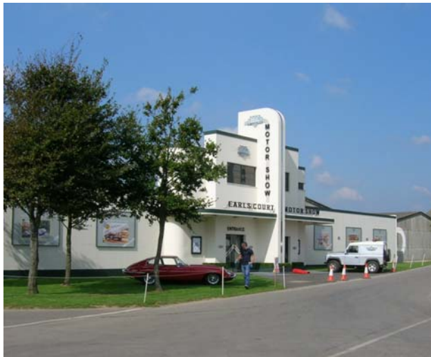
The façade of Earls Court was recreated next to the Paddock within which was a glorious display of period sportscars where visitors were invited to vote for their favourite car.