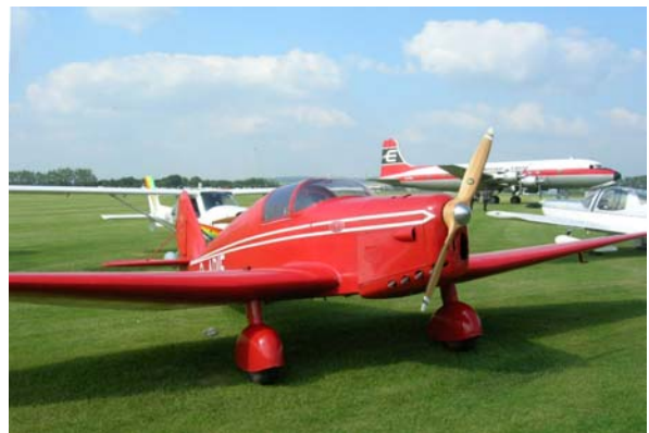
Tipsy made by the Belgian subsidiary of Fairey Aviation was an interesting exhibit along with two other examples of the type.