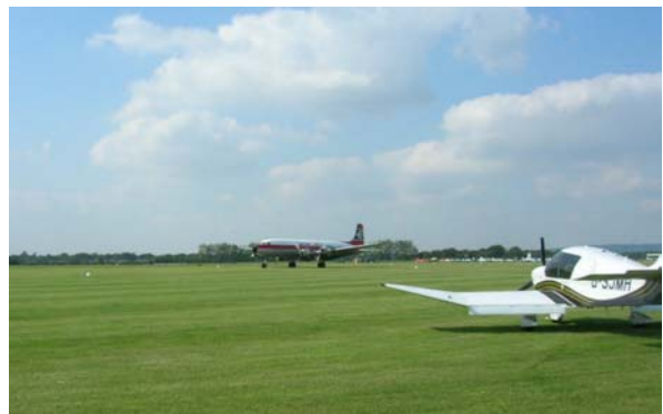
An exciting sight was the arrival of an Eagle Airways DC6, a large four engine airliner making a landing on grass! It demonstrated it needed only 60% of the main runway.