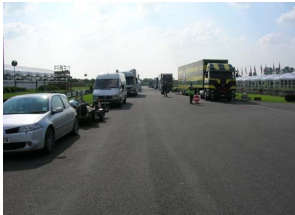
Main straight looking from the start line down to Madgewick Corner