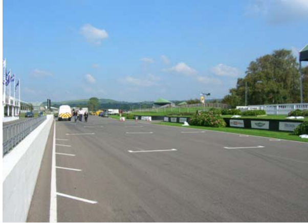
Main straight with the Sussex Downs to the north on a beautifully sunny day

After a depressingly wet Summer in England, the weather turned fine with a fresh easterly breeze for the Goodwood Revival weekend. It was extraordinary luck which helped both the final preparations on Thursday and the three day event!