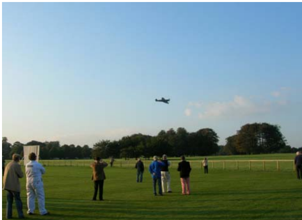
As usual a Spitfire arrived, slightly later this year at just after 6pm, and gave a spirited display over the cricket square