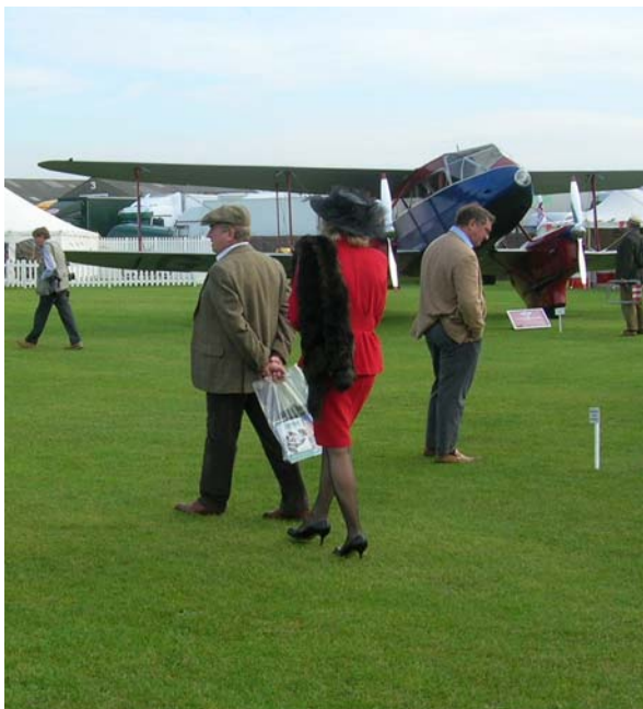
Many people attending make a real effort to dress for the occasion.