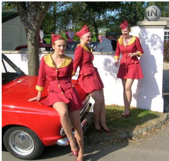
Glamcabs has become a regular feature of the Goodwood Revival providing a useful taxi service.