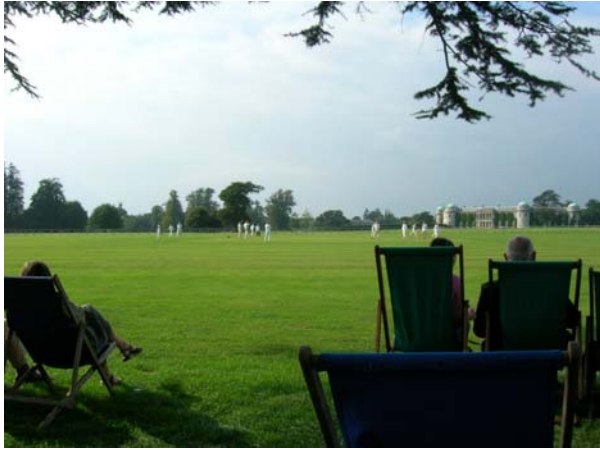
Cricket match in progress with Goodwood House beyond.

A traditional feature of the event is the cricket match at Goodwood House.