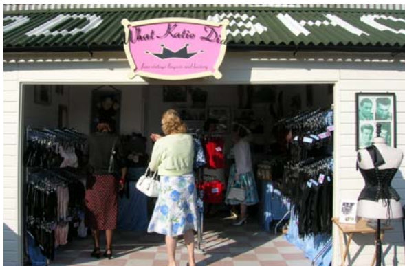
"What Katie Did" was one of the many shops – in this case offering a saucy range of "faux vintage lingerie and hosiery".