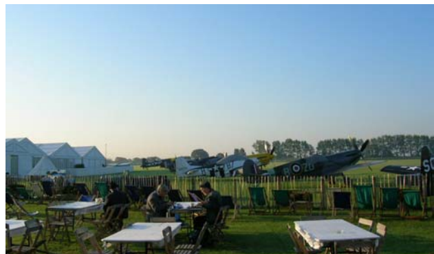
Early morning outside the Spitfire Bar where friends meet up for a traditional English breakfast. Just before 9am the engines of the WW2 fighter aircraft fire up and they move off for their flying display. RV8 enthusiast Peter Kuruber enjoyed the display.