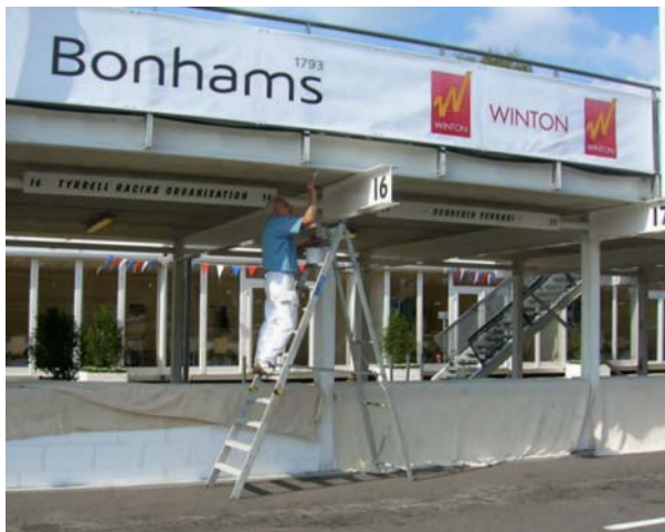
Final painting in the pits