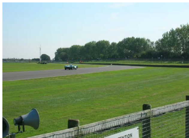
Fordwater is a very fast corner at the back of the circuit and popular with many Goodwood Revival enthusiasts