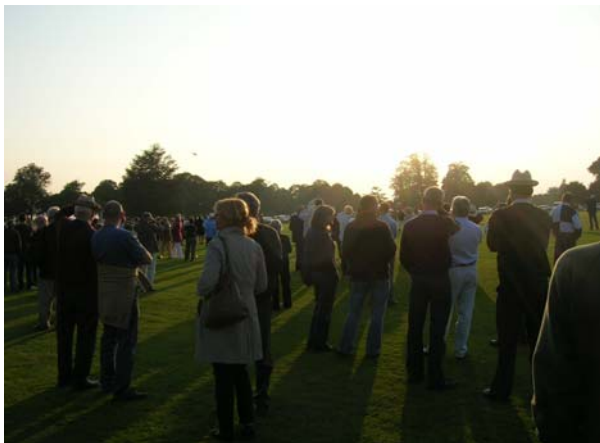
The Spitfire display continued as the sun began to go down. Following the display the drivers and friends assembled in the tea marquee for the Drivers' Briefing. Although it has a characteristically light-hearted presentation, Lord March stresses how important it is for the guest drivers to drive safely in their period cars.