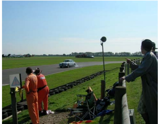
Spectating at St Marys is always a lively place