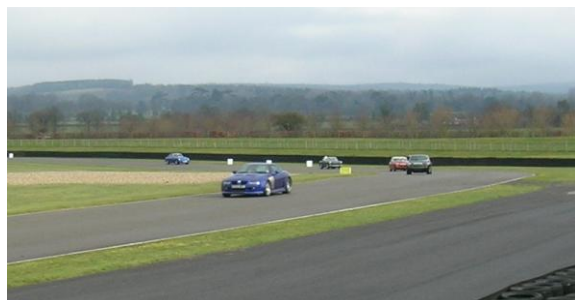
SVR-S of Brian Payne at Madgwick – the sound as it passes at speed is magical