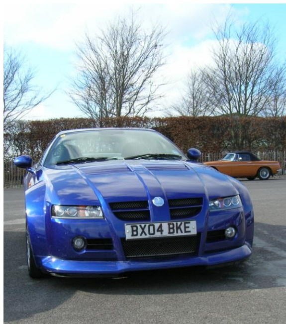
SVR-S in the Paddock as the sun came out