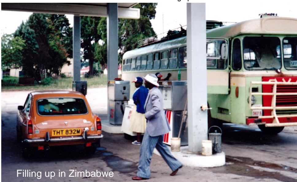
Filling up in Zimbabwe