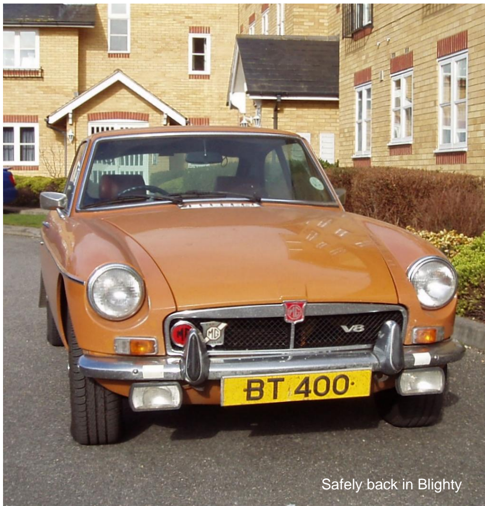
Safely back in Blighty

He adds "the photo alongside is just after the V8 arrived back in the UK after nine